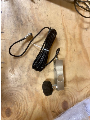
4 - LOAD CELLS