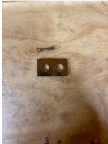
4 - LOAD CELL SHIM