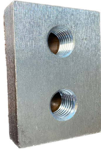
4 - DOUBLE NUT CONNECTOR FOR BOLTS ON LOAD CELL