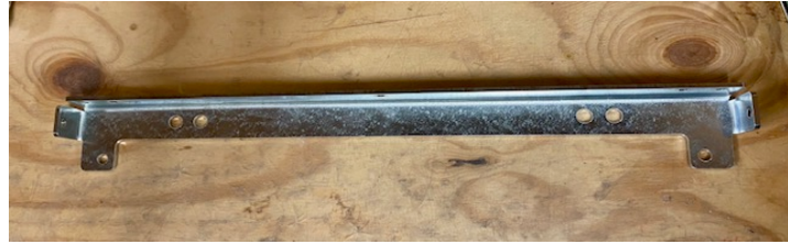
2 - LOAD CELL/FEEDER SUPPORT BRACKET