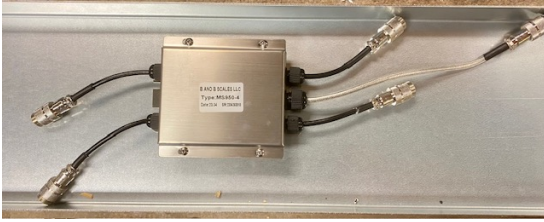
1- CIRCUIT BOARD

**BRACKETS IN PICTURES ARE SOLD SEPERATELY FOR STULL FEEDERS! THIS SCALE KIT CAN BE USED FOR ANY FEEDER. STULL 300/600 UTV FEEDERS DO REQUIRE THIS BRACKET FOR SUPPORT AS STATED IN WARRANTY! YOU CAN MAKE YOUR OWN (**VOIDS WARRANTY**) OR PLEASE CONTACT US FOR PURCHASE AT 800-369-4131**