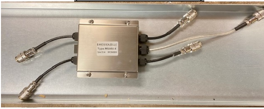
1- CIRCUIT BOARD

**BRACKETS IN PICTURES ARE SOLD SEPERATELY FOR STULL FEEDERS! THIS SCALE KIT CAN BE USED FOR ANY FEEDER. STULL 300/600 UTV FEEDERS DO REQUIRE THIS BRACKET FOR SUPPORT AS STATED IN WARRANTY! YOU CAN MAKE YOUR OWN (**VOIDS WARRANTY**) OR PLEASE CONTACT US FOR PURCHASE AT 800-369-4131**